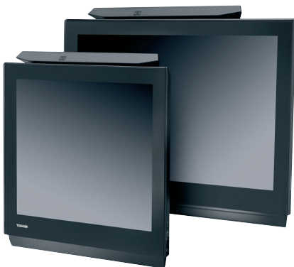
Kiosk configuration landscape viewing