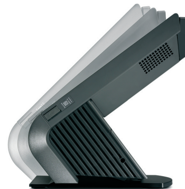
Multiple viewing angles and heights