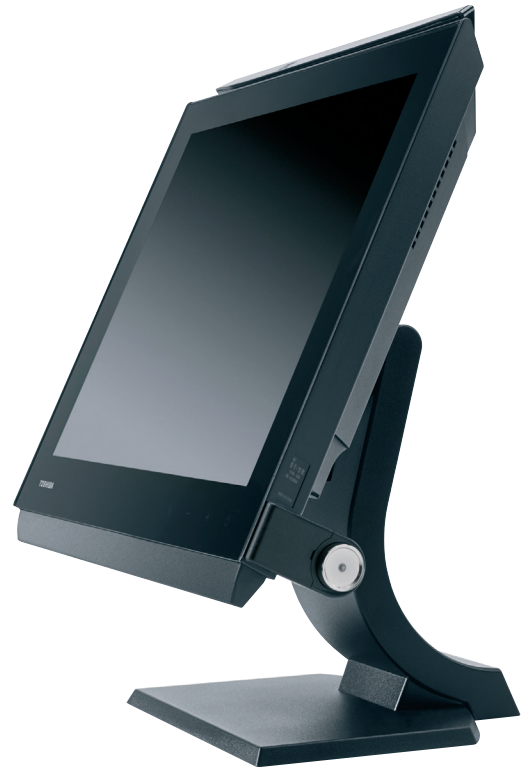
Countertop configuration with optional stand