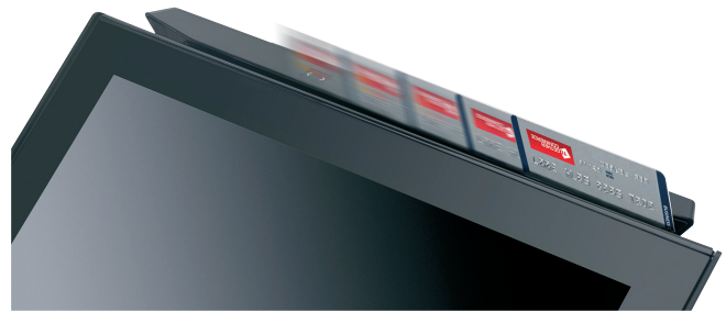
Optional MSR and/or customer display