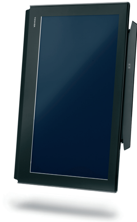
Kiosk configuration portrait viewing