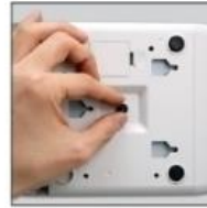
Easy assembly and disassembly with hand screws