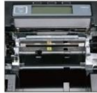
Aluminum main frame structure with low noise & robustness