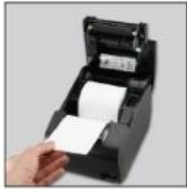
Easy paper loading & Jam Free/Apply auto cutter