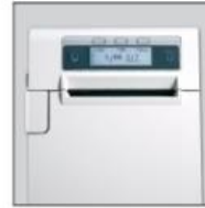
Automatic display pivot function at the wall-mount